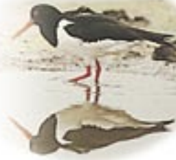
Oyster Catcher, Hayle Estuary